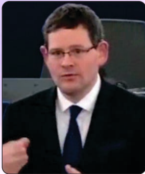
Dr. Adam Kosa Member of European Parliament